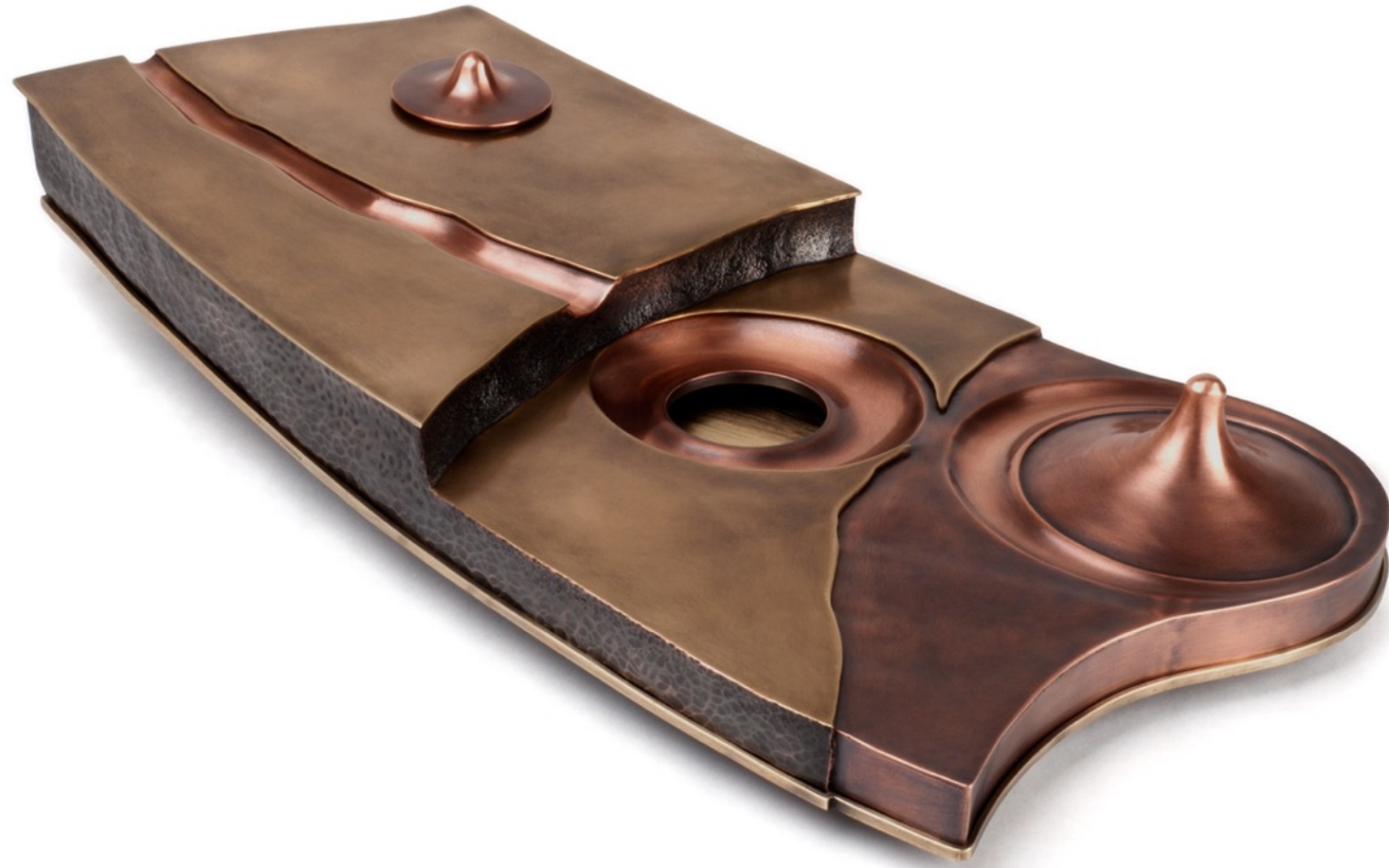
Playscape | vessel, 2014, brass, copper, stainless steel, 2 ½ x 9 x 17 ¼"