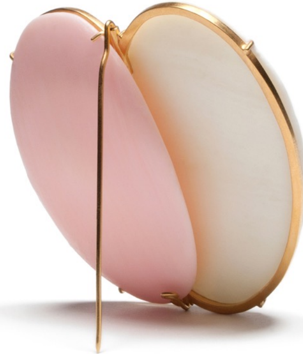
Give and Take | brooch (front and back), 2018, soap, 24K gold plated brass, 18K gold, 2 ½ x 2 ¾ x ¾"