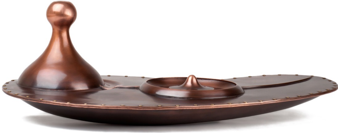
Decoy | vessel, 2014, copper, brass, 5 ¼ x 15 ¼ x 9 ½"