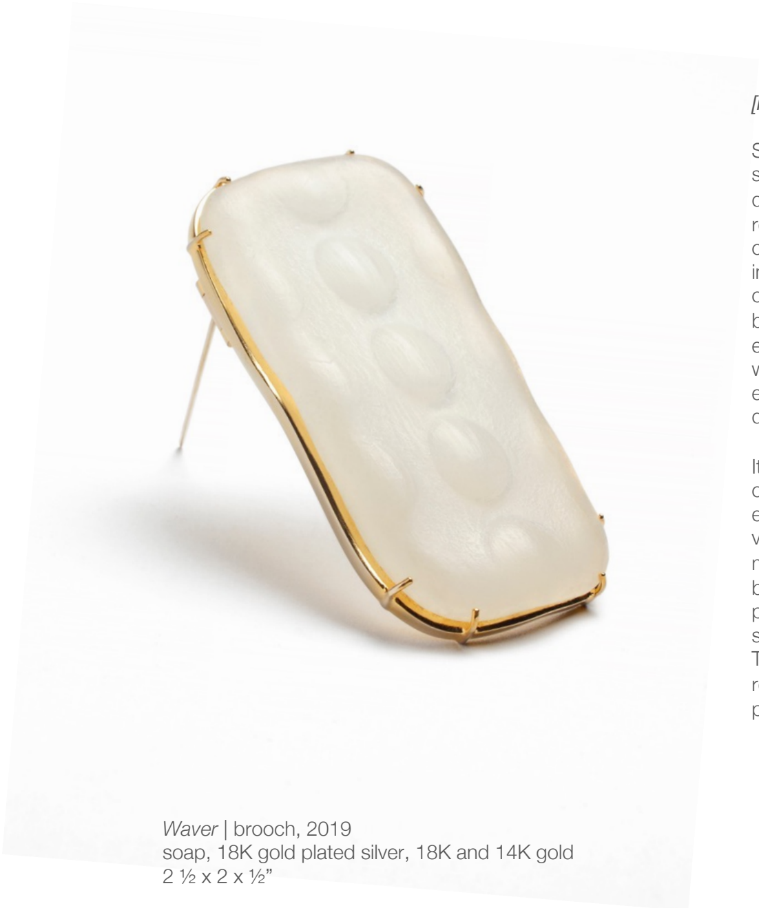
Waver | brooch, 2019 soap, 18K gold plated silver, 18K and 14K gold 2 ½ x 2 x ½”