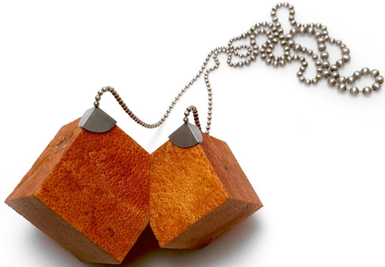
Cubic Tangelo Cluster | pendant, 2016, tangelo peel, plywood, sterling silver, 12 ¼ x 6 ½ x 2 ½"