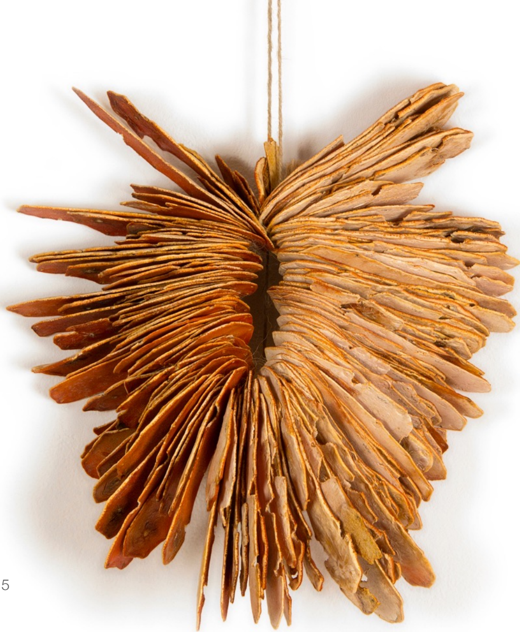
Hiding in the Flesh | necklace, 2015 Tangelo peel, twine, nail 22 x 15 x 7 ½"