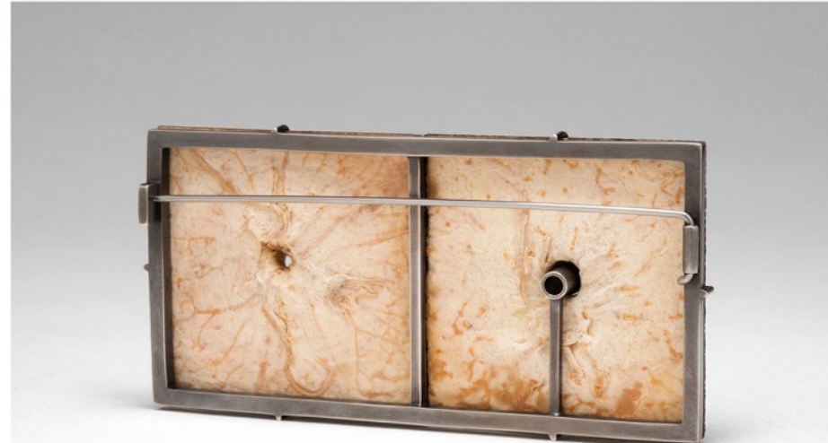
Tips & Corners | brooch (front and back), 2015 laser cut 4383 minneola, 925 sterling silver, 304 stainless steel, faceted stone 1 ½ x 3 x ½"