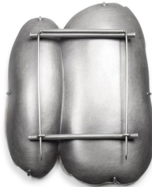
Nestle | brooch (front and back), 2015, soap, sterling silver, stainless steel, 3 ¼ x 2 ¾ x ½"